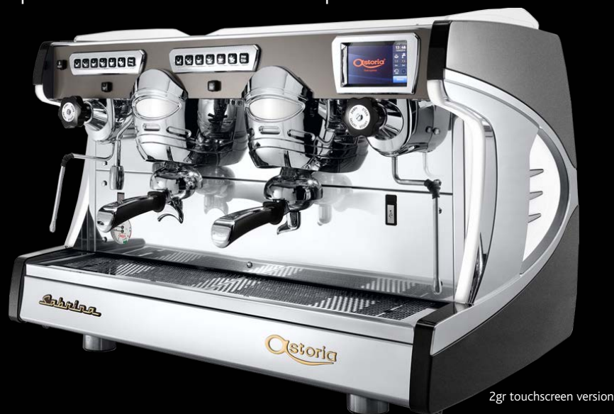
2gr touchscreen version

The Touchscreen model (pictured) features an intuitive touchscreen which relays important information back to the operator.