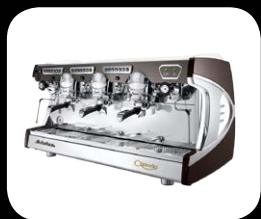
3gr standard version