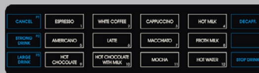
Recommended button config for Self Serve