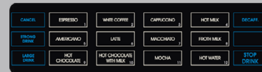
Recommended button config for Operator Serve