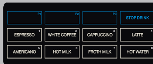
Recommended button config for Self Serve