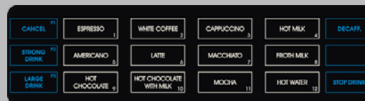
Recommended button config for Self Serve