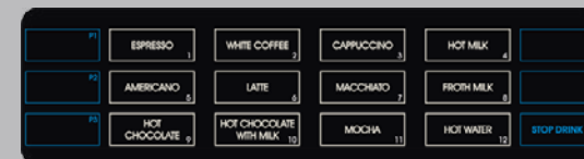
Recommended button config for Operator Serve