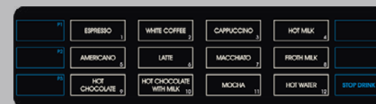
Recommended button config for Operator Serve