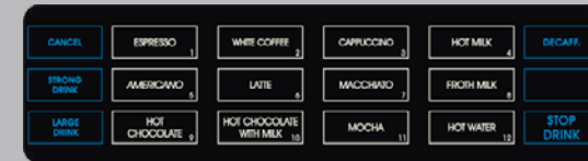
Recommended button config for Operator Serve