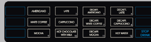
Recommended button config for Self Serve