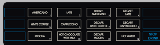
Recommended button config for Self Serve